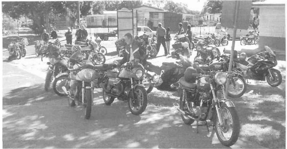
Above: at Silver Sands Park and below: Just enjoying the river view