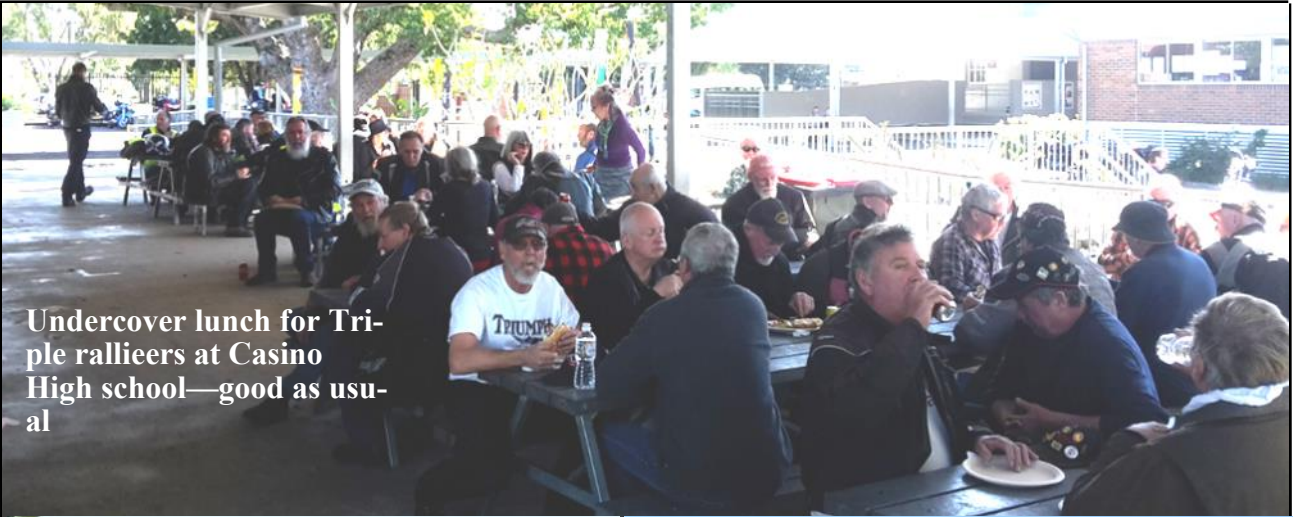
Undercover lunch for Triple rallieers at Casino High school—good as usual