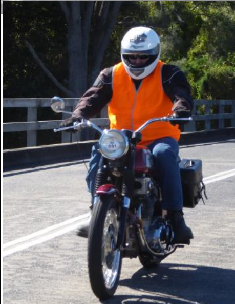
Pictures of the triples rally: Marshals hurrying to keep in front; Riders on the Whyralla Bridge, Riders discussing the bikes,, and the girls prepare bacon and egg rolls and coffee for breakfast. GREAT!