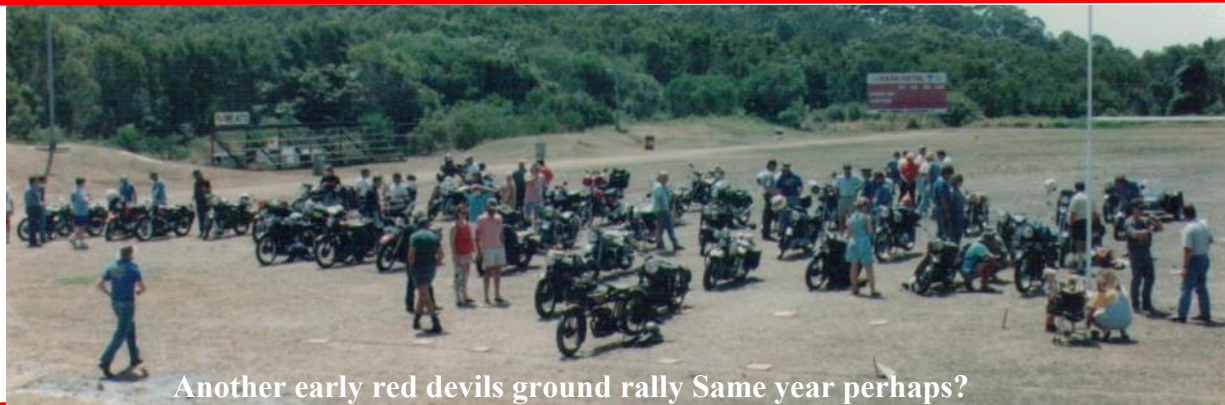
Another early red devils ground rally Same year perhaps?