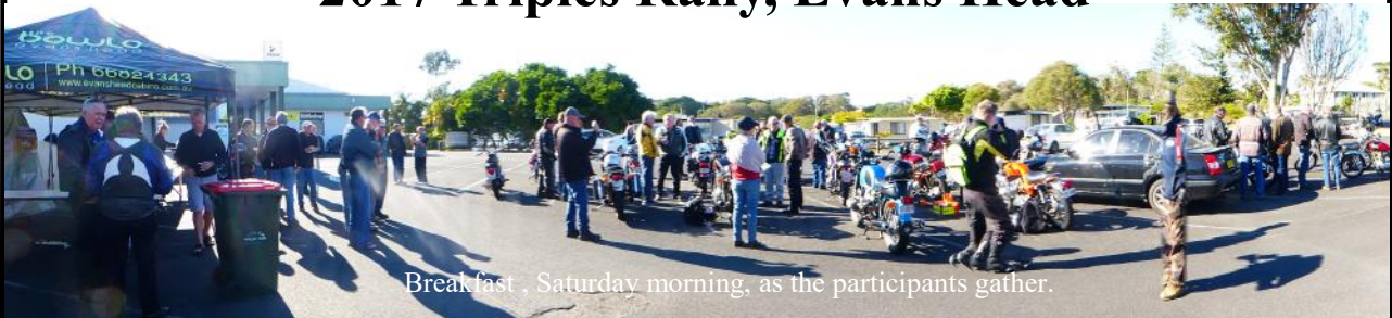
Breakfast, Saturday morning, as the participants gather.